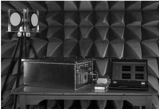
Tools for defending against electromagnetic attack (right to left): an antenna set (on tripod) for sensing the environment, a RF measuring device for conditioning the signals and a computer that calculates the relevant data.

Electronic devices can withstand a certain amount of radiation. This is measured in volts per meter (V/m) – called the electromagnetic compatibility (EMC). Otherwise, they would not operate reliably. Every device could interfere with others in its immediate vicinity. Depending on the category of usage, they therefore have to fulfill specific EMC requirements. These are significantly higher for industrial applications than for common things like Smartphones, televisions, or stereo equipment. One example where safety is important is automotive engineering. “The importance of electronic components will continue to increase in the future. Completely shielding individual devices from electromagnetic radiation would certainly be theoretically possible, but much too expensive though. Systems are needed that can detect these kinds of attacks. If you know what is attacking, you can also react correctly to it,” according to Jöster.