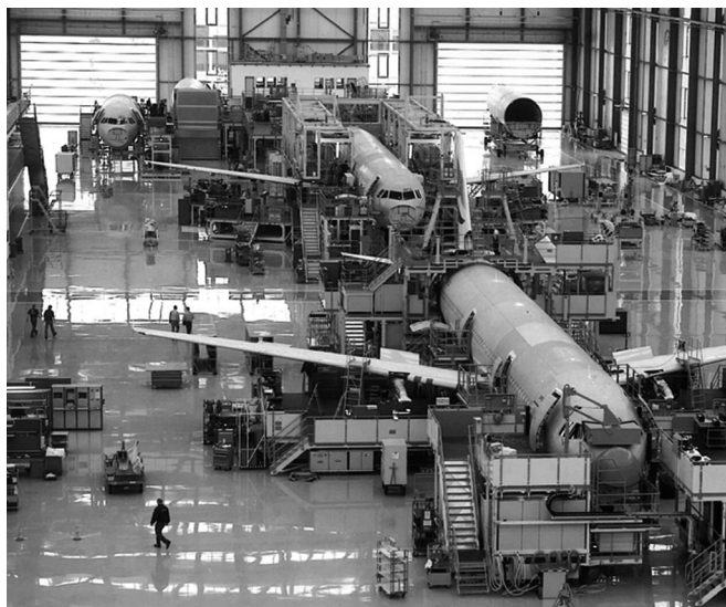
Airbus production hall in Hamburg: using the "Eco-Design Software Tool," Life Cycle Assessments can now be performed even during the design phase.