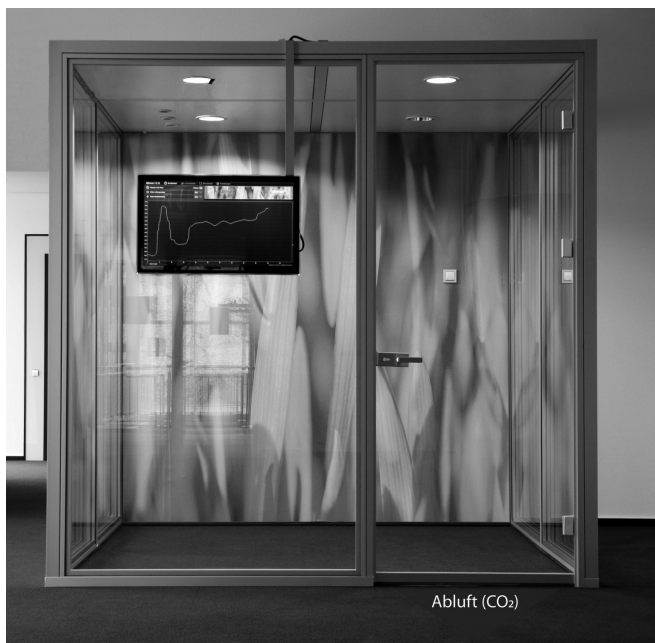
On display at the Fraunhofer inHaus-Center in Duisburg beginning in June: the door seal system developed by IMS.

Indeed, Fraunhofer researchers have already set their sights on further applications: in the future, the door seal may well also help regulate humidity in residential and commercial buildings. This may soon make mold in the home and dry eyes in the office a thing of the past.