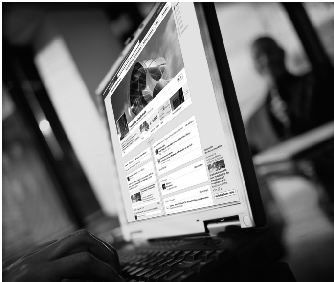
User-friendliness versus privacy protection: SIT is investigating ways of developing user-friendly software tools for social networks.

With their work, the researchers want to help improve the design process of software for social networks. The results of the study are regularly presented to the community of researchers, and the analytical tool is available as open source software. In March of last year, the project team was presented with the coveted Google Faculty Research Award for their efforts on behalf of improved privacy protection.