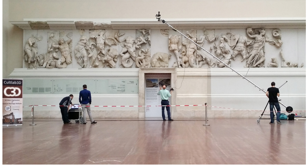
Researchers use a laser scanner to scan the frieze of the Pergamon Altar. © Fraunhofer IGD | Picture in color and printing quality: www.fraunhofer.de/en/press