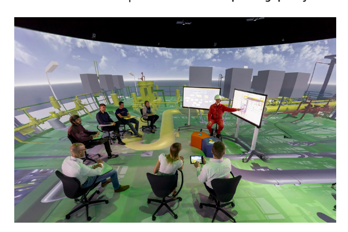
The Elbedome provides space sufficient for a team of industrial planners or can be used as a marketing tool that enables as many as thirty visitors to experience virtual environments at the same time. © Fraunhofer IFF | Picture in color and printing quality: www.fraunhofer.de/en/press

The Elbedom is simultaneously a discovery, learning and creative space and can improve communication with clientele effectively. Staff can be trained effectively and experts can share experiences in the virtual training environment. © Fraunhofer IFF | Picture in color and printing quality: www.fraunhofer.de/en/press