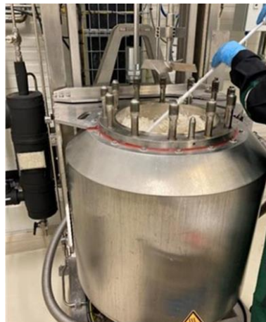
Figure 3: The process was scaled up at Fraunhofer CBP, where several kilograms of chicken feathers were processed.