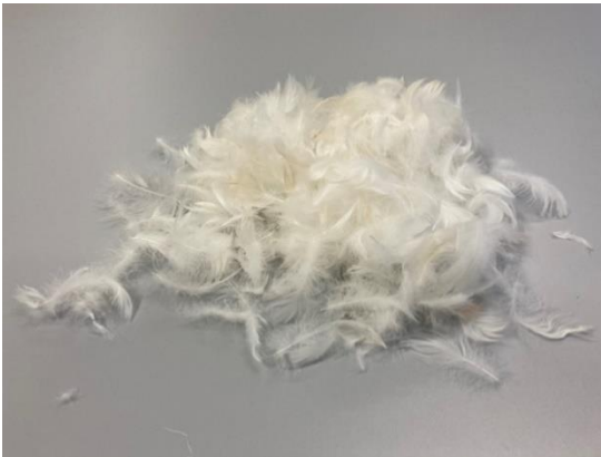
Figure 1: Feathers contain keratin, a structural protein insoluble in water that can be used to manufacture adhesives.