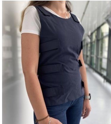
Fig. 1 Acoustic sensors are integrated into the front and back of the textile vest to listen to the thorax.