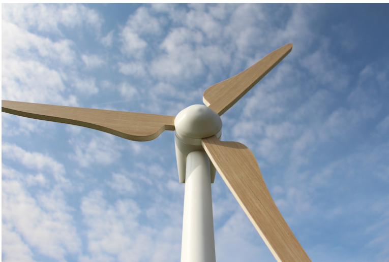
Rotor blades made of thermoplastic sandwich materials.