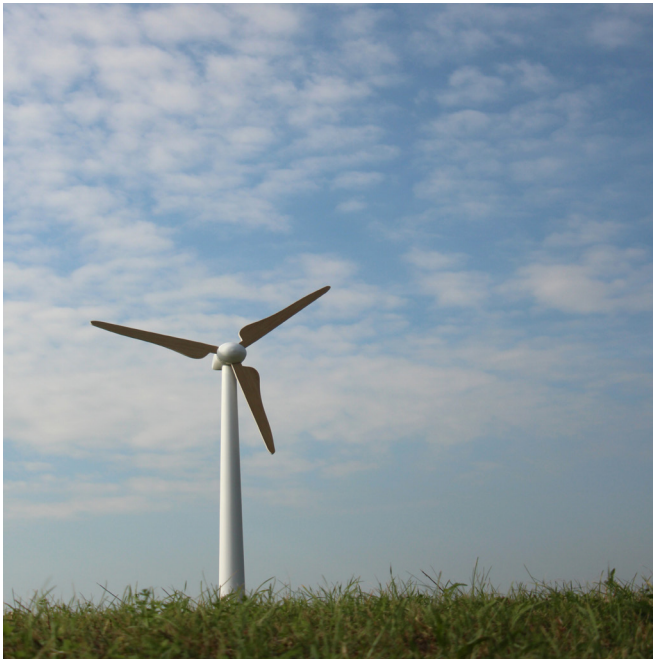
A model wind turbine with blades made from sandwich elements. © Fraunhofer ICT | Picture in color and printing quality: www.fraunhofer.de/en/press