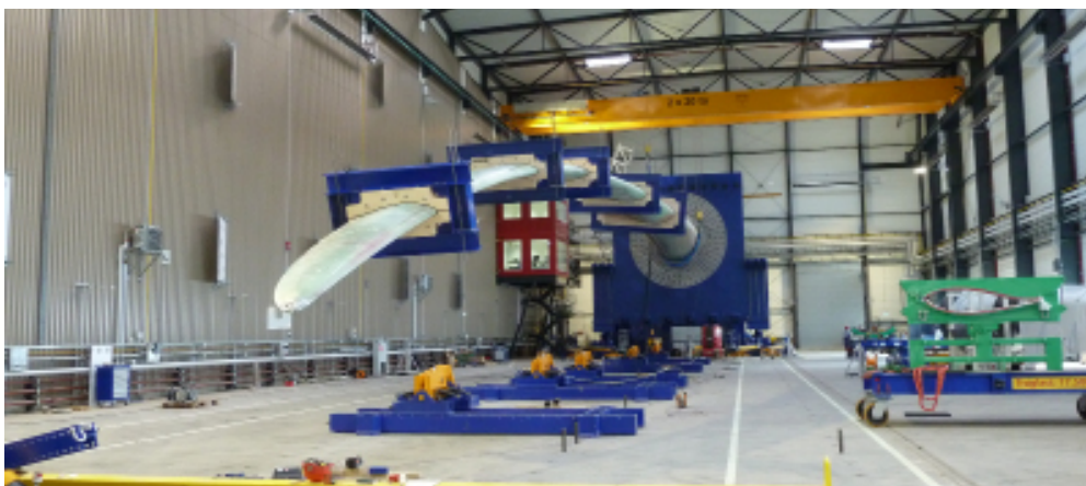
Static testing of the trailing edge of a rotor blade. Acoustic emission sensors were able to detect and locate all defects. © Fraunhofer IWES | Picture in color and printing quality: www.fraunhofer.de/en/press