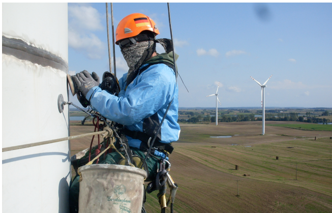
Experts carrying out a visual inspection © Seilpartner GmbH | Picture in color and printing quality: www.fraunhofer.de/en/press