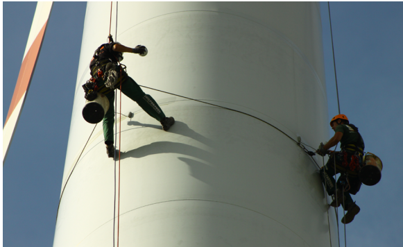
Industrial climbers abseiling down a rotor blade. © Seilpartner GmbH | Picture in color and printing quality: www.fraunhofer.de/en/press