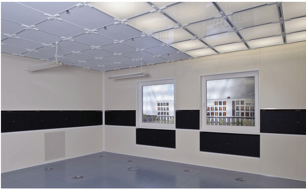
RESEARCH NEWS May 2018 || Page 3 | 3