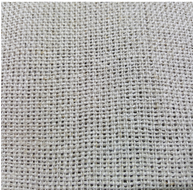
Plain-woven flax fabric © Jana Winkelmann | Picture in color and printing quality: www.fraunhofer.de/en/press