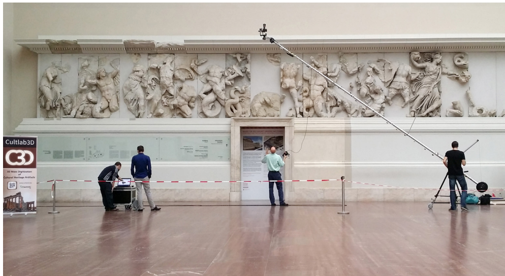
Researchers use a laser scanner to scan the frieze of the Pergamon Altar.