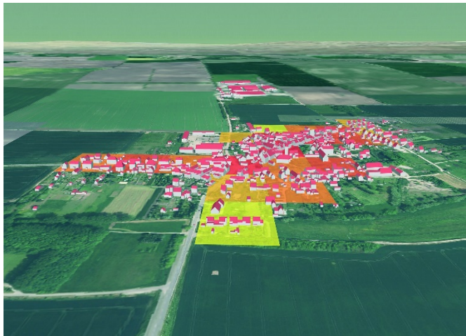
Picture 1: Visualization of heating demand for the municipality of Neumark (486 inhabitants) in a 100 x 100 m grid. Dark colors indicate high energy demand. The results were estimated based on the building structures.

© Open Data Thüringen | virtualcitySYSTEMS GmbH | Layout: Daniel Cebulla (JENA-GEOS@-Ingenieurbüro GmbH)