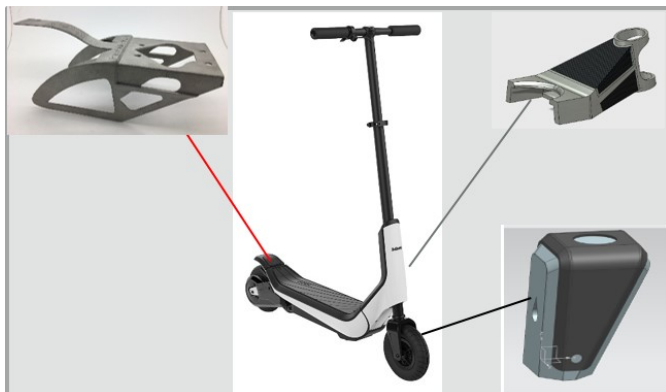
Fig. 2 Diagram: Smart solutions to join carbon fiber reinforced plastics and metal.