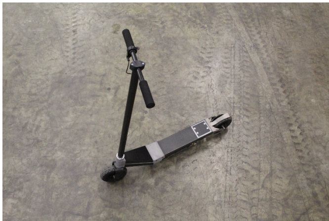
Fig.1 Hybrid metal and carbon fiber reinforced plastic e-scooter

Fraunhofer Researchers will be showcasing the e-scooter and the joining techniques described in this article at the Hannover Messe from April 1 to 5, 2019 (Hall 17, Booth C24). For anybody interested, there will be the opportunity to take a test drive and find out more about the design and manufacture of the individual components.