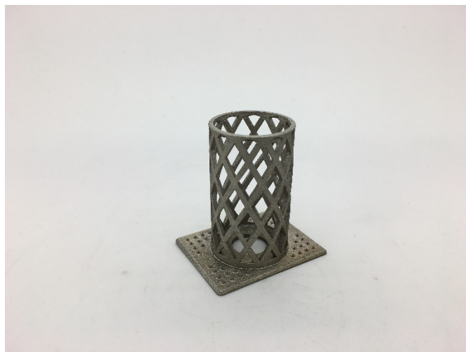
Fig. 4 Connecting piece prior to lamination, showing the novel pin structure that helps create a positive bond with the CFRP prepreg.