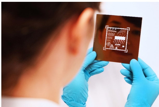
Picture 1: UV light penetrates through a patterned photomask onto a substrate, where it cures a polymer incorporated in the thick film. This technique is used to create fine structures with a resolution of as low as 20 micrometers.

The Italian company Aurel is developing suitable production plants exactly tailored to the new PI pastes from Fraunhofer IKTS. These will also be on show at Productronica (Hall A2, Booth 481). “This extremely promising technology is easily integrated in standard thick-film processes – a field in which Aurel has over 50 years of experience,” explains Fabio Pagnotta, sales and marketing manager at Aurel. “We have therefore opted to launch a high-performance unit, featuring LED illumination and spray jet systems, for use in both small-scale and mass production. The Aurel systems can be used as a standalone unit or as a module incorporated in a fully automated production line, where it will keep pace with the typical cycle times of a standard thick-film production line. Fine lines and combined structures represent a cost-effective alternative to thin-film and solid-state designs for applications such as HF and microwave modules, sensors, chip components, 3D stack interposers and fan-out substrates.”