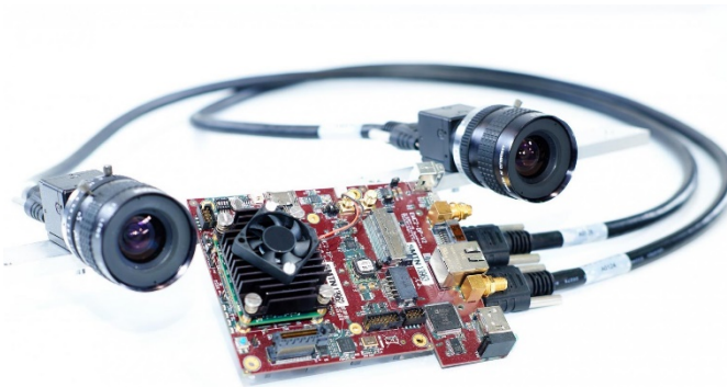
Picture 2: The stereo camera and the embedded system installed on the drone.