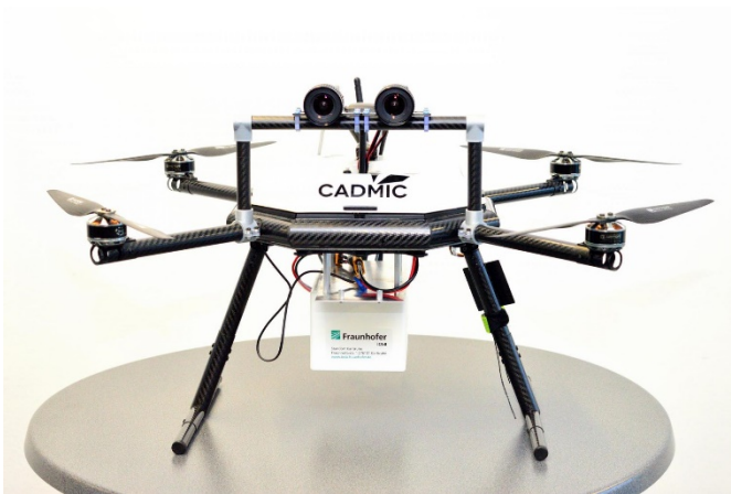
Picture 1: Drone with stereo camera. The small white box holds the embedded system, which evaluates the slightly offset images from the two cameras in real time in order to detect obstacles.