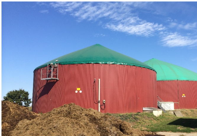
Picture 2: Fraunhofer researchers intend to produce hydrogen in biogas plants too.