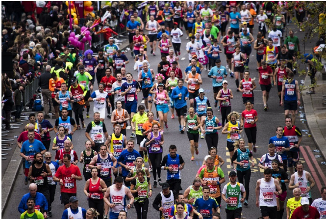
Picture 1: Sporting events such as city marathons are a favored target of terrorist attacks.