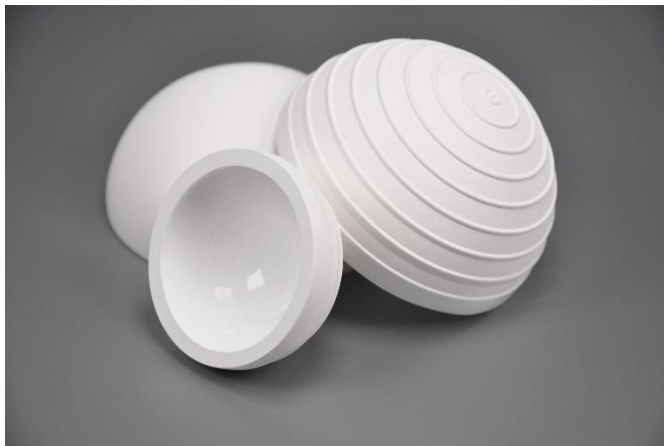
Picture 1: The cast half-shells for resurfacing prostheses are structured on one side to improve bone cell adherence. The other side is completely smooth.