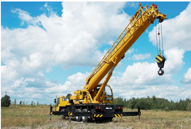
Picture 1: Due to highly complex controls and dynamism, mobile cranes are ideal for rapid prototyping with HiL simulation (icon).