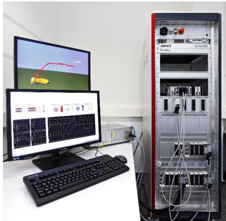
Picture 2: The Fraunhofer ITWM HiL platform enables data collection and generation for many signal types as well as complex fault simulations. The control algorithms can be integrated into its own control units or the customer's original systems.