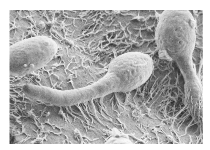
Fig. 1 The fungus Candida albicans on intestinal cells as seen under the microscope.

RESEARCH NEWS September 1, 2020 || Page 3 | 4