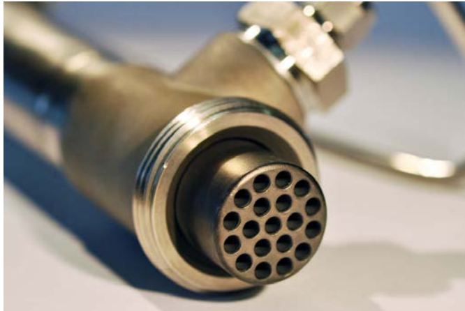
Fig. 1 The 19 channels in the carbon membrane enlarge its surface area, and this in turns encourages a higher substance throughput.