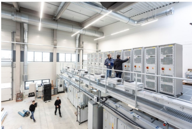
Fig. 1 The Multi-Mega-watt Lab at Fraunhofer ISE in Freiburg makes it possible to achieve highly precise characterization of the electrical properties of converters up to a power of 10 MW.