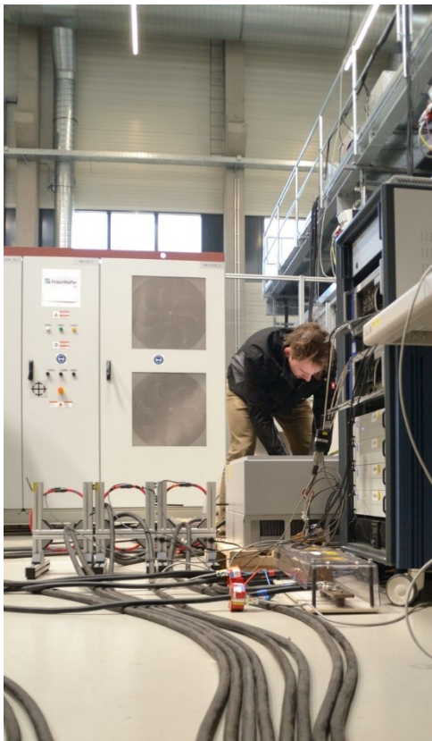
Fig. 3 For the measurement-related proof of the grid-forming properties of converters, the power grid was simulated under laboratory conditions.