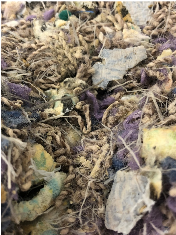
Picture 2 Broken-down carpet waste that is subsequently cleaned and has ionic liquid added to it.