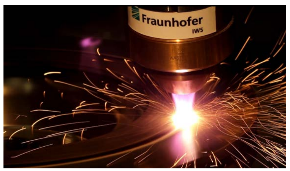
HICLAD enables high-quality corrosion coatings in an efficient process.

The Fraunhofer-Institut für Werkstoff- und Strahltechnik IWS Dresden stands for innovations in laser and surface technology. As an institute of the Fraunhofer-Gesellschaft zur Förderung der angewandten Forschung e. V., IWS offers one stop solutions ranging from the development of new processes to implementation into production up to application-oriented support. The fields of systems technology and process simulation complement the core competencies. The technology fields of Fraunhofer IWS include PVD and nanotechnology, chemical surface technology, thermal surface technology, generation and printing, joining, laser ablation and separation as well as microtechnology. The competence field of material characterization and testing supports the research activities.