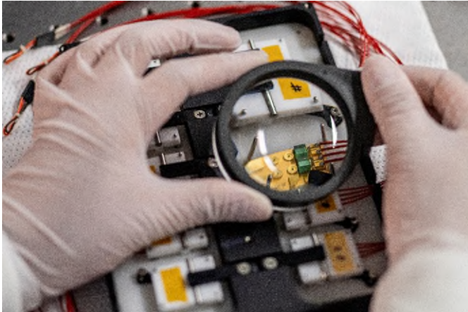
Picture 2 Raman spectrometer the size of a 50-cent piece.