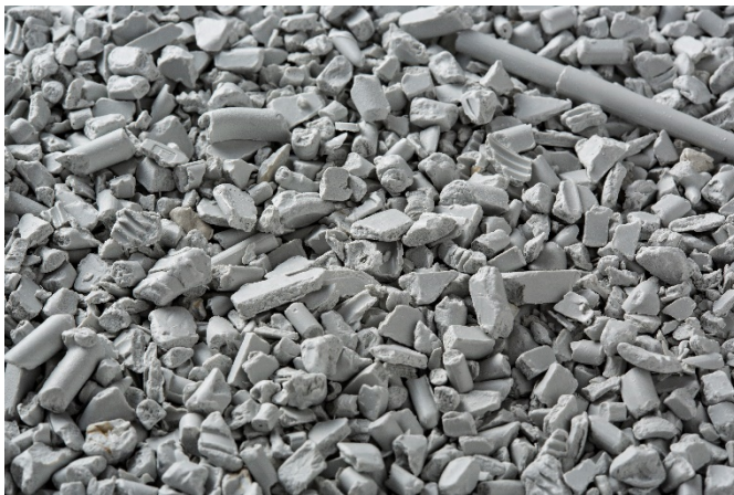
Picture 2 Plastic granulate from recycled plastic