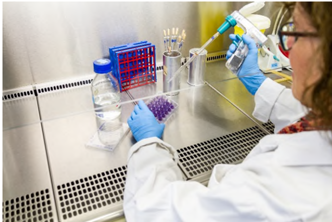
Fig. 1 Researchers use a plaque assay to test cell cultures and determine whether viruses are infectious.