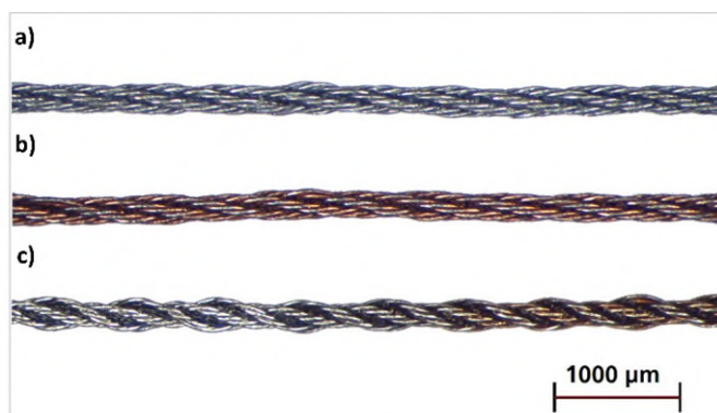
Abb. 2 Single (a, b) and double (c) coatings of different biopolymers applied to demonstrators of molybdenum pacing leads.