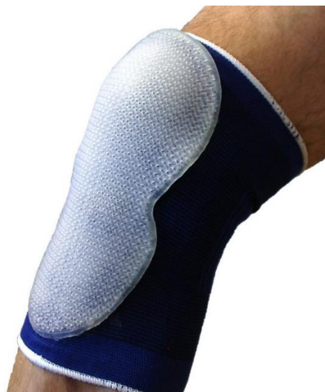
Fig. 4 Redesigning knee protectors: in a collision, the TPMS structure distributes the energy across the entire surface area and therefore provides a better protective effect than knee protectors that use a honeycomb structure or shock-absorbing foam.