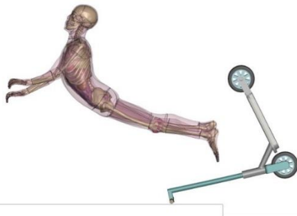
Fig. 3 The moment shortly after impact in the simulation. The human model is catapulted into the air over the handlebars.