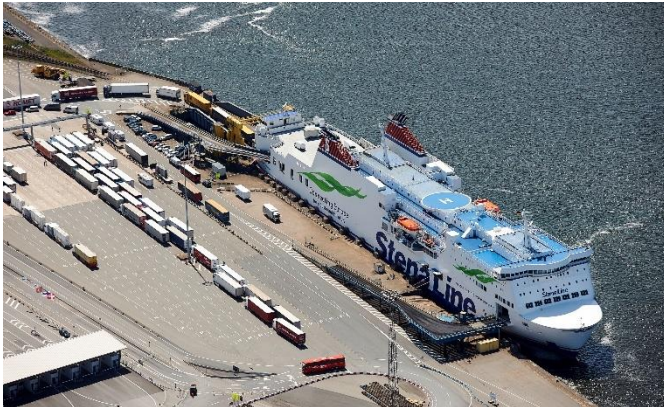
Fig. 1 An increasing number of alternative fueled vehicles are transported via ferries. Shipping companies such as Stena Line must respond to this development by implementing new safety systems on board.