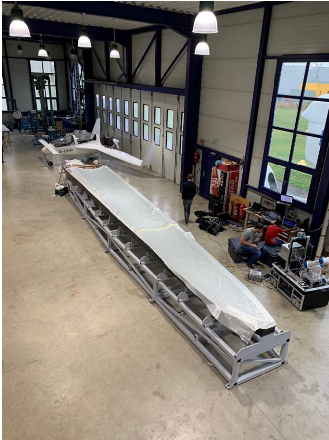
Fig. 1 Rotor blade tip with the fiber layer package laid out at Aeroconcept GmbH.