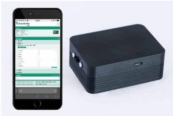
Fig. 1 Fraunhofer IDMT's click detection can be integrated into the reporting system and be displayed via an interface. The microphone can be integrated into a work glove and can also be combined with a smart-watch.