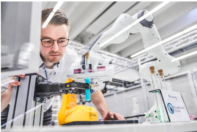
Fig. 1 Fraunhofer IEM is researching intelligent gripping systems. At the Hannover Messe 2023, it is presenting an innovative robotic gripper that does not use complex pneumatics.

The system’s spatial radius of action can be expanded with a linear axis, i.e., a horizontal track. To do this, the robot gripper is mounted on a vertical lifting column, which is attached to the linear axis. The gripper is suitable for safe human-robot collaboration thanks to its sensor-based environment recognition system. This is not the case for the axes (both the linear axis and the lifting column), however. To render the entire workspace collaborative, the researchers have developed a 360-degree environment recognition system that monitors the full length and height of the axes and can be integrated into the base of the linear axis. “With this multi-sensor system, which includes distance and thermographic sensors, the entire cobot and axis structure can work collaboratively. This means that businesses don’t need to install safety barriers,” says Henke. “The gripper can either be combined with the linear axis and multi-sensor system or used on its own.” Initial tests have been successful, and the Fraunhofer IEM team is now looking for partners to manage bringing the robot gripper to market.