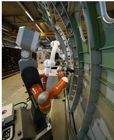
Fig. 3 The SWAP-IT architecture can be used in many different sectors, such as aircraft construction. Fraunhofer researchers will be presenting a series of practical demos at the Hannover Messe.