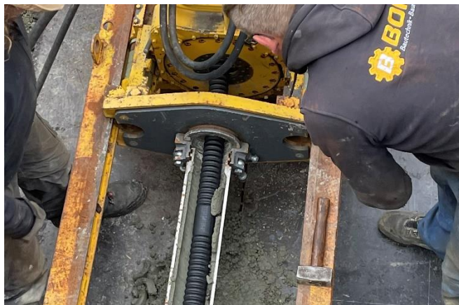
Fig. 3 GeoHoP: Geothermal probes inserted horizontally or at an angle can harvest heat under buildings in existing districts.