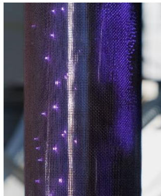
Picture 1: The plasma atmosphere is clearly visible in the reactor through the characteristic glow and flashes of light.

The AtWaPlas joint research project launched in July 2021. After a successful series of pilot-scale tests with a 5 liter reactor, the Fraunhofer team is now working with the joint research partner to further optimize the process. Georg Umlauf states: "Our current objective is to completely eliminate toxic PFAS by extending process times and increasing the number of circulations in the tank. We also want to make the AtWaPlas technology available for practical application on a larger scale." The future could see corresponding plants set up as standalone purification stages in sewage treatment plants or used in portable containers on contaminated open-air sites.