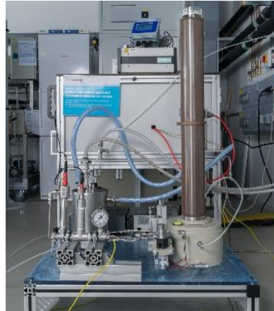
Picture 3: Pilot plant for the elimination of PFAS. Following the initial success of the trials, the technology is now to be optimized and scaled up for practical applications on an industrial scale.