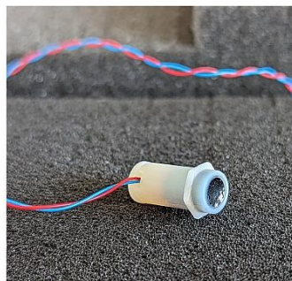
Fig. 1 Parallel manufacturing process for the sensors (left) and final ultrasound transducer after their integration into the housing (right).