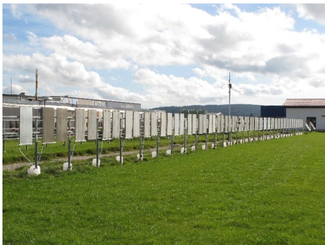
Fig. 1 Facade plaster samples were exposed to the elements for 18 months. After each rainfall, they were tested in the laboratory.