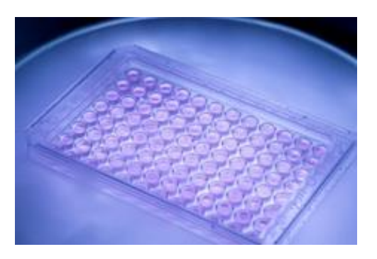
Figure 1 Ice-free cryopreservation (vitrification) of adherent cell systems in the R2U-Tox-Assay multiwell format.