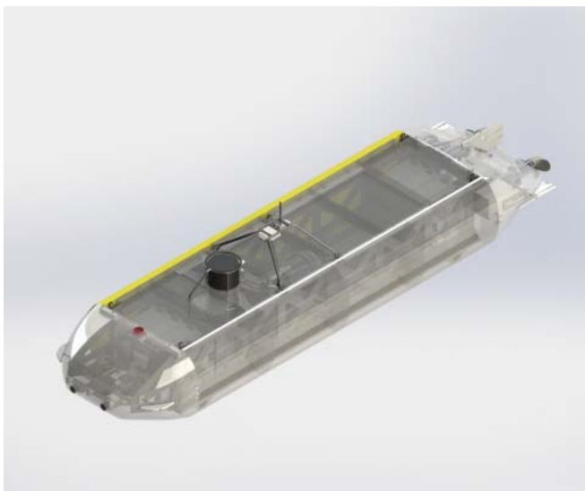
The autonomous underwater vehicle can reach depths of 6000 meters. © Fraunhofer IOSB-AST | Picture in color and printing quality: www.fraunhofer.de/en/press