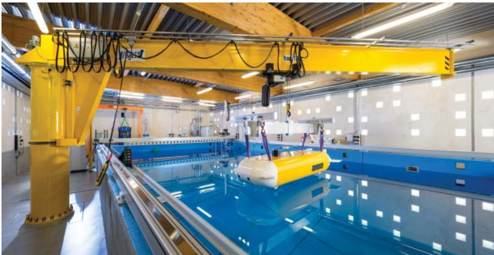
The underwater vehicle suspended above the maritime systems research platform with its slewing crane, portal system and (in the background on the left) pressure chamber.