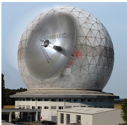
Fraunhofer FHR's space observation radar TIRA.

© Fraunhofer FHR | Image in color and in printing quality: www.fraunhofer.de/en/press