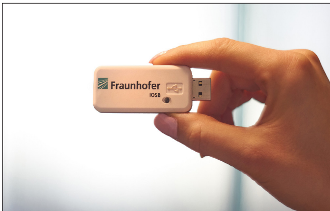
RTLSflare as a USB stick. © Fraunhofer IOSB-AST | Picture in color and printing quality: www.fraunhofer.de/en/press

In addition, visitors to the special exhibition “Time” at the phaeno Science Center in Wolfsburg can see the RTLSflares in action: this positioning solution will be used to illustrate the GPS operating principle. The exhibition is open through February 3, 2019.