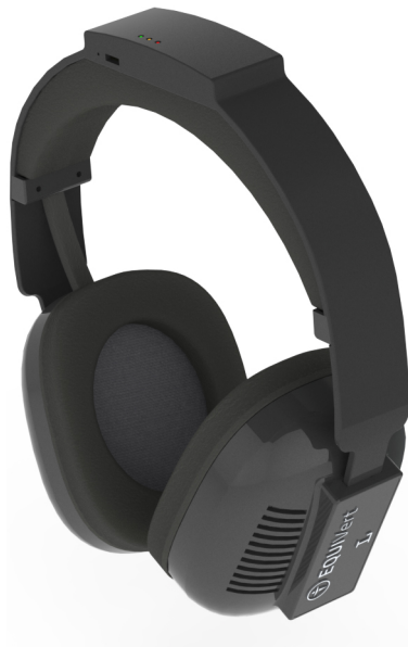
The EQUIFit Patient's Device © GEDmbH | Picture in color and printing quality: www.fraunhofer.de/en/press