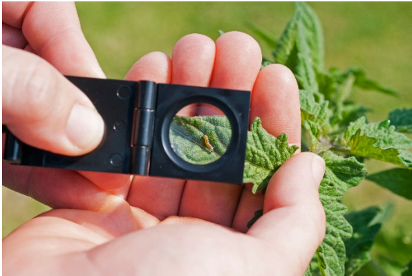
Picture 1: Pest damage to crops can be avoided with the use of pheromones.