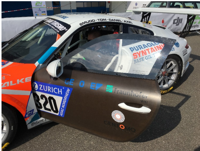
Picture 1: The Bioconcept-Car's driver and passenger doors and rear wing are made using a mixture of organic fibers. Vegetable fibers as a component in organic composites are a sustainable alternative for lightweight vehicle bodies.