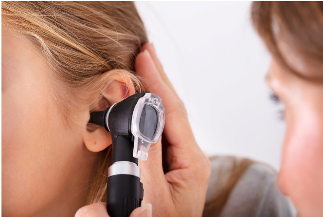
Picture 1: Thanks to sensor technology developed by Fraunhofer IPMS, a new device from OtoNexus Medical Technologies will radically enhance the diagnosis of middle ear infections.