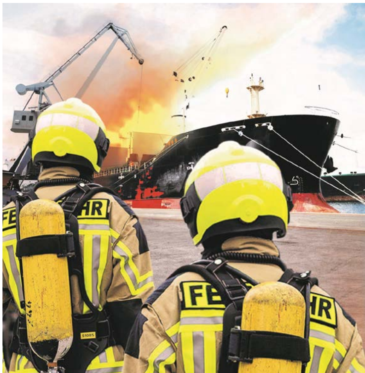
Fig. 2 Shipboard fires pose a particular challenge for firefighters