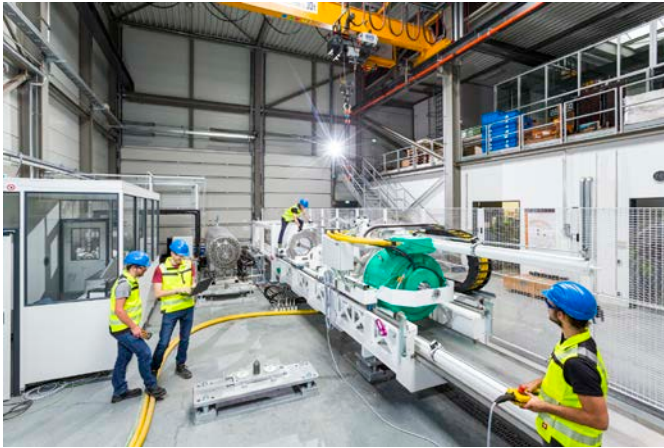
Fig. 1: Geotechnologies department staff prepare the rig for testing.