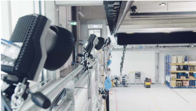
Picture 3 Fraunhofer IIS reference system.