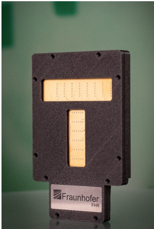
Picture 1 MIMO radar sensor for motion capture, developed at Fraunhofer FHR.