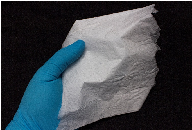
Picture 1 Electrospun nonwoven of biotechnologically produced tropoelastin.